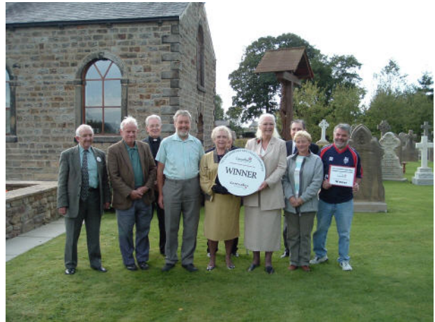
SS Peter & Paul's receive their trophy from Lancashire County Developments Ltd

What a bumper year it's been for the locality in the Best Kept Village competition! The Parish Council constantly strives to keep our environment up to scratch, but it is a pleasant bonus to receive praise from official quarters. And so, to the honours list.... Knowle Green Village Hall was awarded the certificate of merit for the best-kept public hall, while the hamlet of Knowle Green was highly commended in the small village class. But pride of place must go, once again, to SS Peter & Paul's for being the overall winner of the Place of Worship class. With an award in each of the previous eight years success has been no stranger to the volunteers who work so hard to keep the Church and grounds in pristine condition and for which the awards are fully justified.